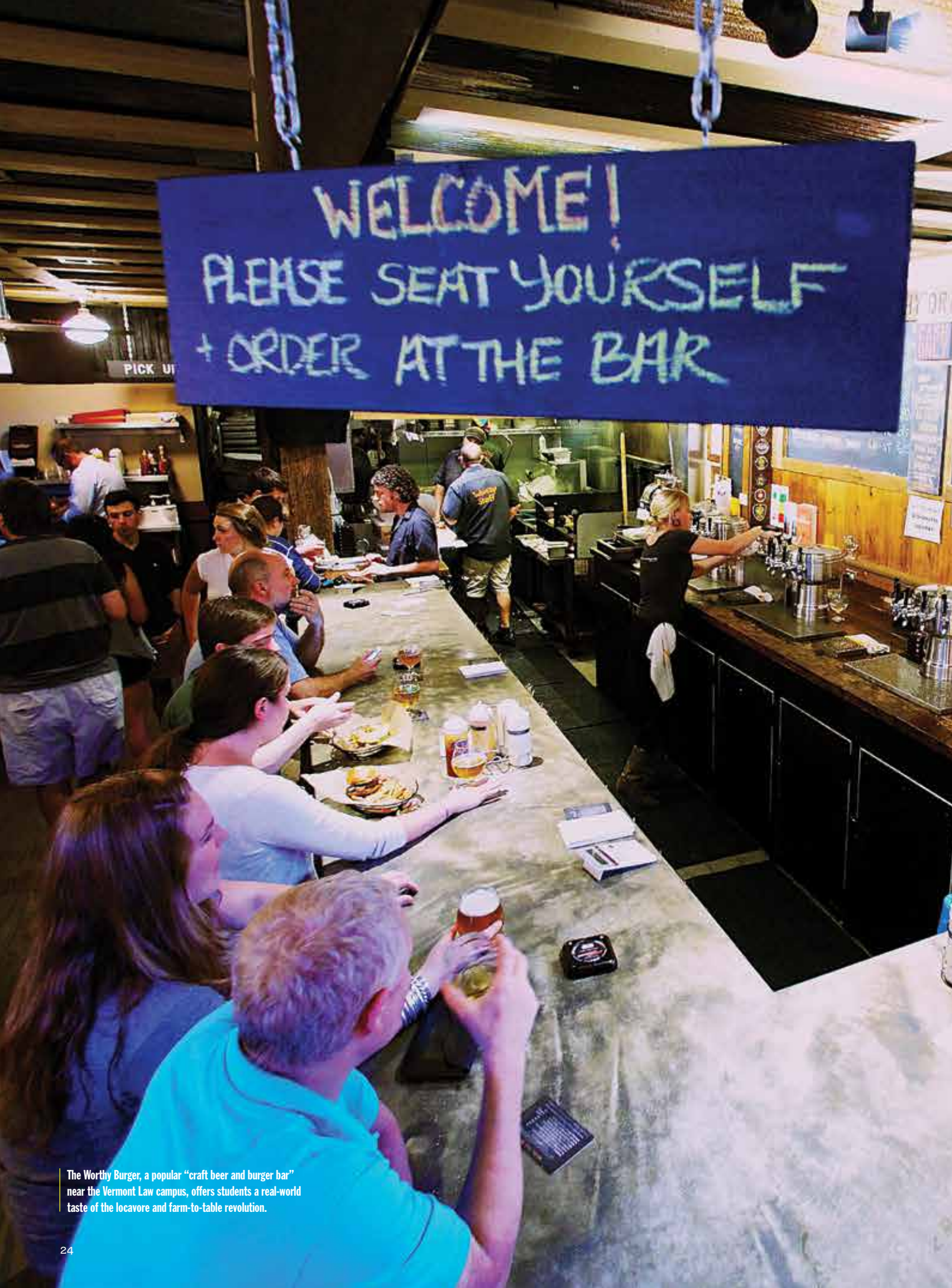
The Worthy Burger, a popular “craft beer and burger bar” near the Vermont Law campus, offers students a real-world taste of the locavore and farm-to-table revolution.