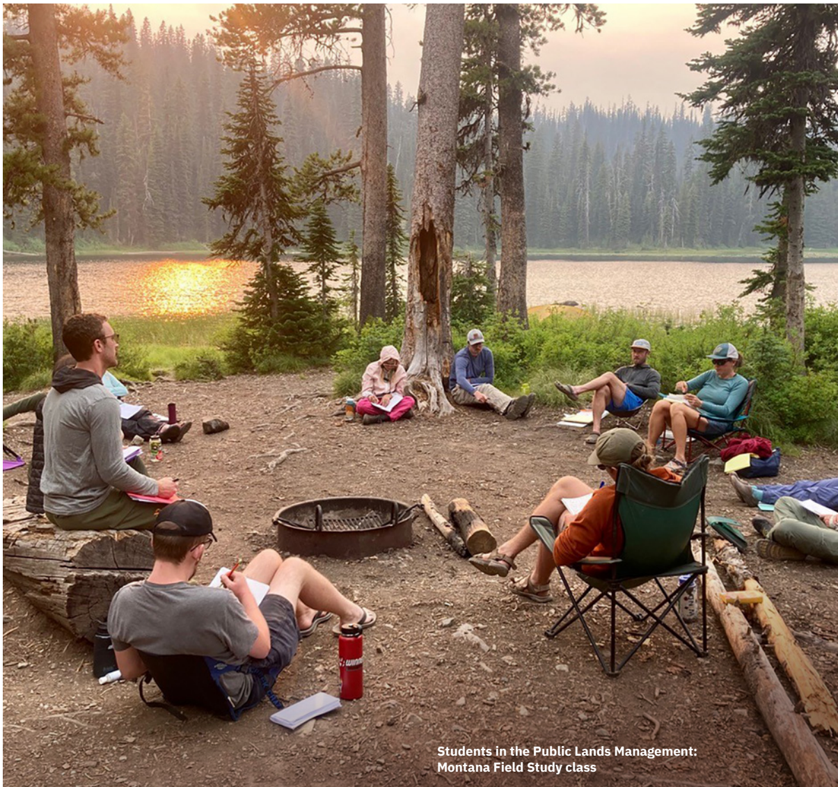
Students in the Public Lands Management: Montana Field Study class