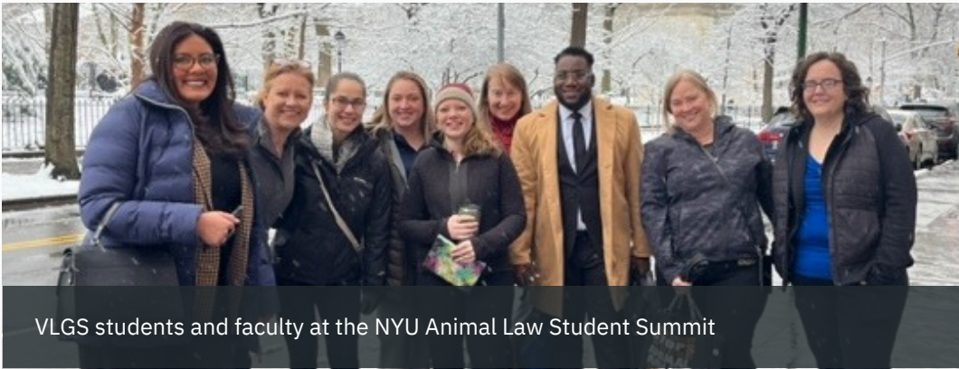
VLGS students and faculty at the NYU Animal Law Student Summit

Throughout the year, faculty and students participated in and contributed to dozens of conferences, competitions, academic publications, media interviews, and events.