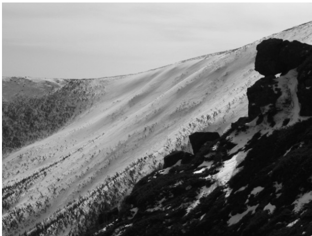
Gulf of Slides in late March

White Mountains, NH - Above treeline skiing at its best. To avoid avalanche danger, ski in the spring and check for avalanche danger at Tuckerman.org for great condition info. 2.5 hours away, and worth it. There is some fabulous skiing in the White Mountains. From the West and miss the above treeline experience? Go to NH and ski in the White Mountain National Park. As a base, always start in Pinkham Notch Visitors Center for updated weather and snow conditions. From there, you can access Gulf of Slides, Tuckerman Ravine, and the Mt. Washington Snowfields. Pitch is between 25 degrees (snowfields) and 55 degrees (Tuckerman Ravine), with Gulf of Slides being slightly less steep than Tucks, but offering longer descents. Tuckerman is a complete zoo in April and I've found that when Tucks can have hundreds of people, Gulf of Slides will be limited to only a few dozen, at most. Youtube Tuckerman Ravine (or Tuckerman's Ravine - as some people incorrectly call it), and you'll see what I mean. Enjoy!