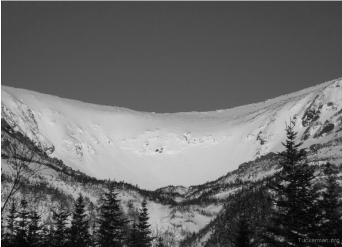
Tuckerman Ravine in early April

Remember: There is no ski patrol for backcountry skiing (Tuck's being the exception). Best to go in groups of two or more.