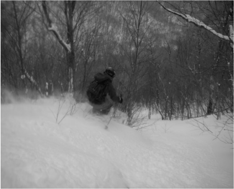
Ben Leoni '11 dropping in at the Notch