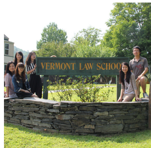
Visiting Chinese students at VLS this summer as part of the U.S.-China Student Collaborative Research Fellowship Program.