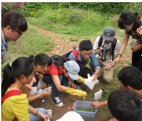
Students test water quality in Caohai wetland

In March 2014, the Partnership conducted a capacity-building training for nineteen student clinicians. The training consisted